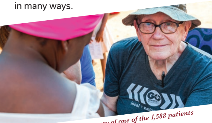
Checking the blood pressure of one of the 1,588 patients

T his September, Jericho Road Ministries partnered with Mobberly Baptist Church for the first time in Zambia to bring a medical clinic and evangelistic efforts to the Petauke area. The Lord blessed greatly in many ways.